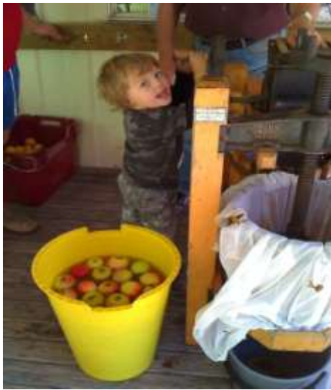
Young participant at the Ashbourne Family Festival crushing some apples with Gusto.