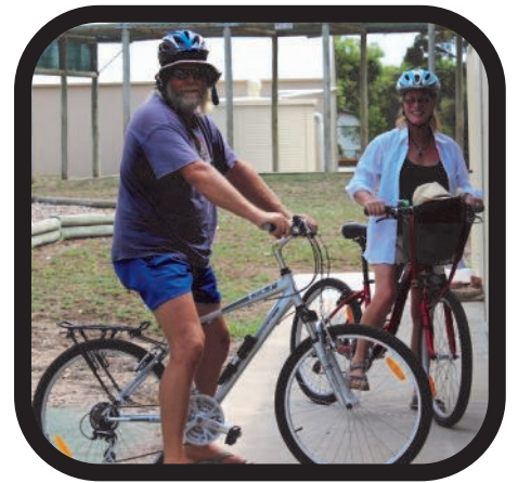
Visitors taking the Hire Bikes for a ride to check out Milang and surrounds.