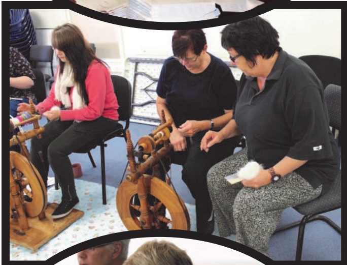
Coming to grips with IPADs , felting, spinning and straw bale building plus a bit of fun in Reception with our volunteers